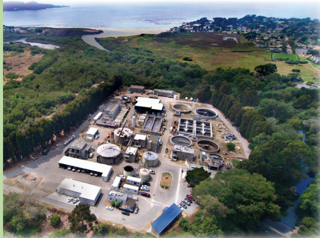
KEEPING IT CLEAN Thanks to your support, our community's vital wastewater treatment plant will continue to safeguard human health and the environment for many years to come.

Your District board and staff are keenly aware of the need to keep user fees low given our current COVID-19 crisis. These are difficult times, and we recognize that the community is struggling and will likely continue to struggle during the coming year. Our rate model, provided by the State Water Resources Control Board, recommended an increase of $5.06 per month in our largest category, residential. Your elected board of directors rejected this increase, and asked staff to cut budgets to reduce fee increases as much as possible, while still ensuring safe operations.