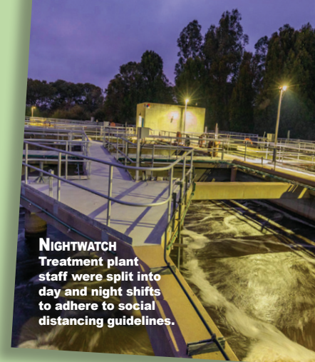
NIGHTWATCH Treatment plant staff were split into day and night shifts to adhere to social distancing guidelines.