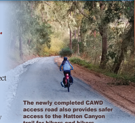
The newly completed CAWD access road also provides safer access to the Hatton Canyon trail for hikers and bikers.

Thanks to the collaborative effort of CAWD, MNS Engineers, Graniterock construction, and California State Parks, the $212,000 project was fast-tracked, completed on time, and within budget. The .4 mile repair improved drainage, and a compacted aggregate was used instead of concrete or asphalt, which will prevent disruption of pH scales in local waterways. The newly resurfaced road is now safer for CAWD crews who use it weekly to perform inspections, and it's allowing more people to enjoy the riparian forest, grasslands, and wildlife in the canyon.