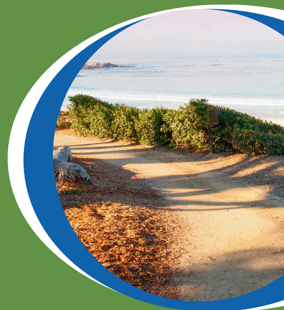
Scenic Road Walking Path