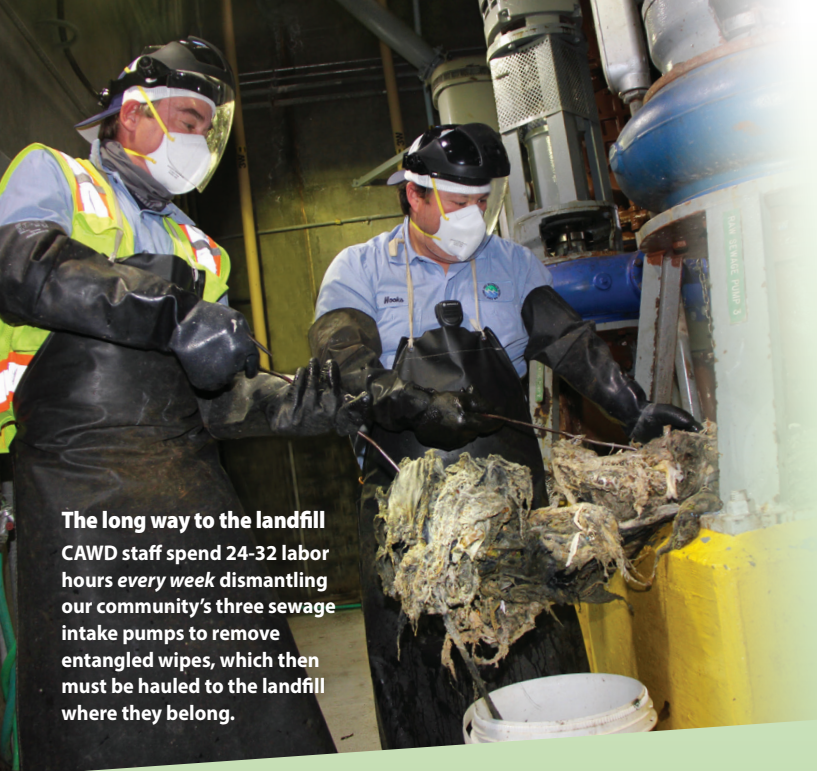
The long way to the landfill CAWD staff spend 24-32 labor hours every week dismantling our community's three sewage intake pumps to remove entangled wipes, which then must be hauled to the landfill where they belong.